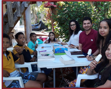
Reaching the Children