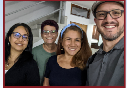
Encouraging the saints