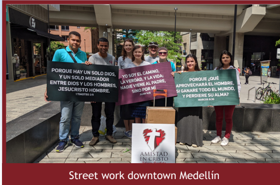
Street work downtown Medellín