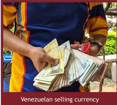
Venezuelan selling currency